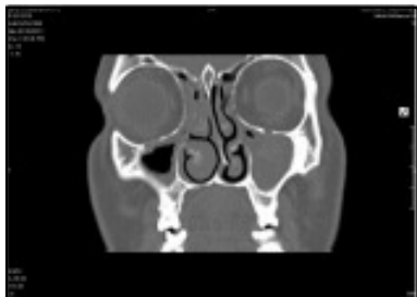
Fig 1. Coronal Section of Osteomeatal Complex Showing Mucosal Thickening of all the Sinuses, Deviation of Nasal Septum to the Left with Bony Septal Spur Impinging on the Inferior Turbinate and Atrophy of Left Turbinate along with Compensatory Hypertrophy of Right Turbinate

by disc diffusion test according to Clinical Laboratory Standard Institute which showed sensitivity to amikacin, trimethoprim-sulfamethoxazole, ceftriaxone and gentamicin, but resistance to amoxicillin-clavulanic acid, ampicillin, ciprofloxacin, erythromycin and doxycycline. Patient was started on trimethoprim-sulfamethoxazole (TMP-SMX) for 6 weeks and improved gradually over the period of time.